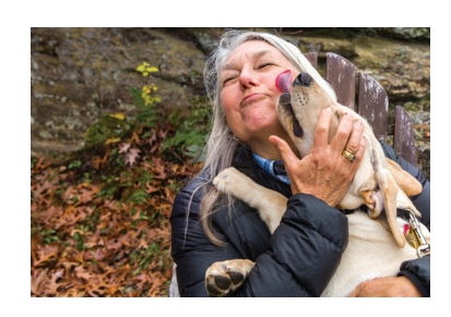
Your personal care