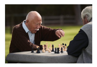
Your care team